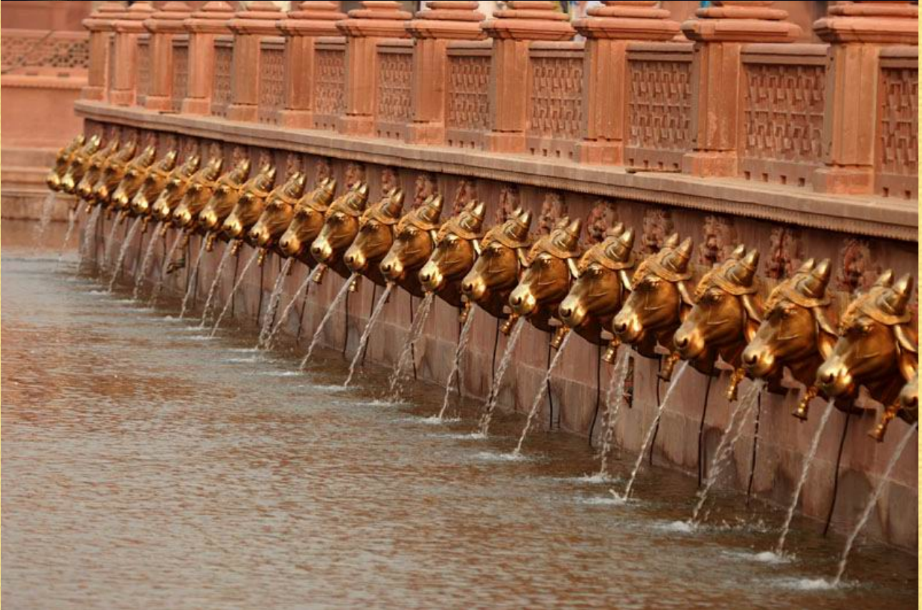
Images - Akshardham temple